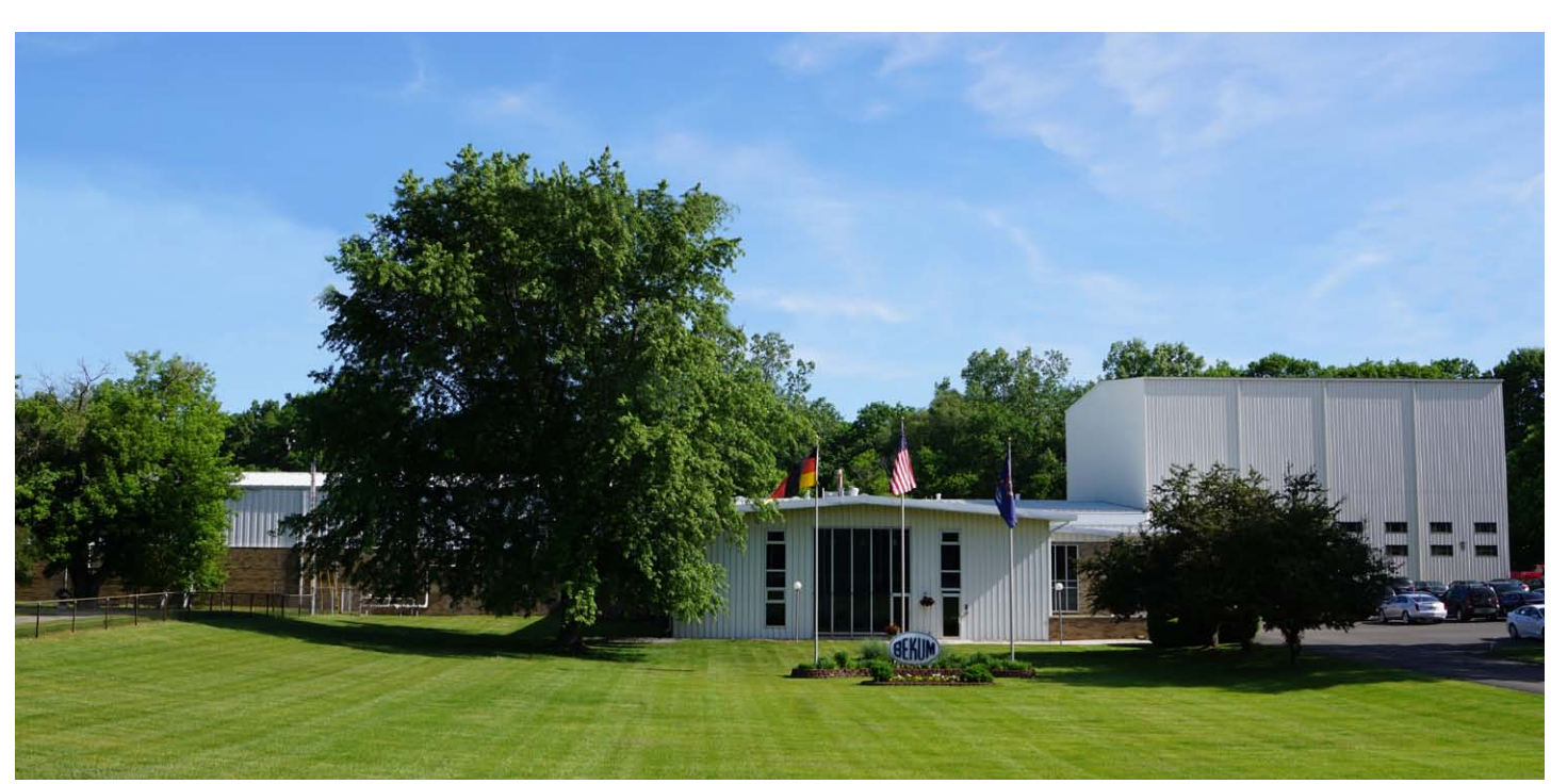
BEKUM America Corporation, Williamston/Michigan USA